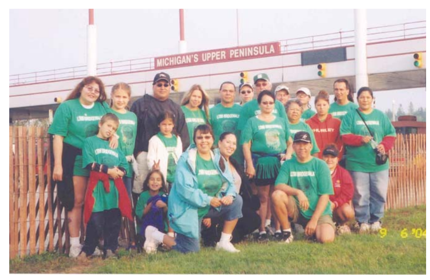
Pictured Above: Tribal Members who walked the Mackinaw Bridge on Labor Day, Septermer 6, 2004.