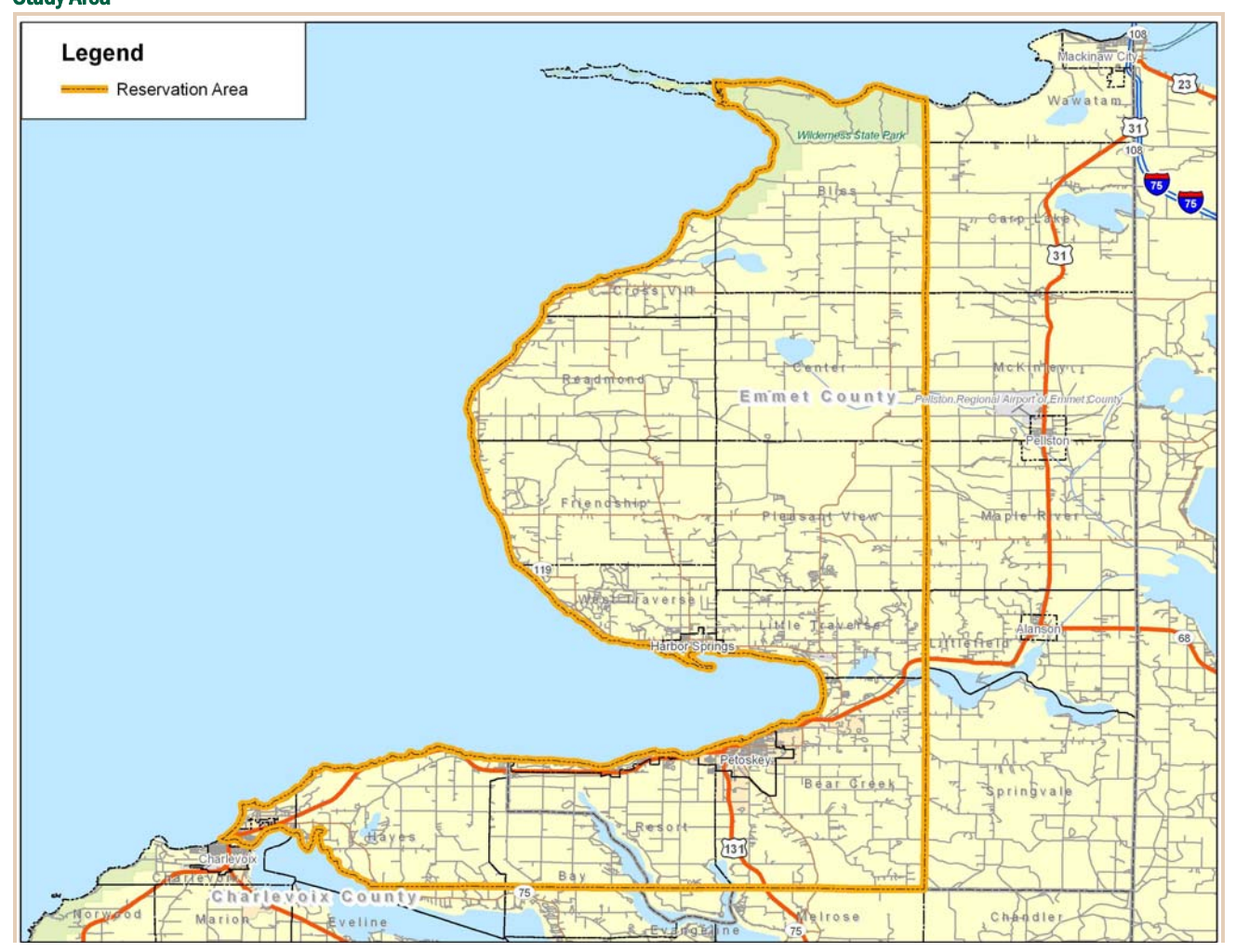
Figure 2-1 Study Area

The primary area of focus for the Tribal Transit Plan is the Reservation Area. This consists of portions of Emmet and Charlevoix counties (Figure 2-1). Given that there are a significant number of Tribal Citizens that reside in areas adjacent to the Reservation Area, such as the remainder of Charlevoix and Emmet counties and Cheboygan County, some portions of the analysis and documentation of transportation needs may extend outside the Reservation Area.